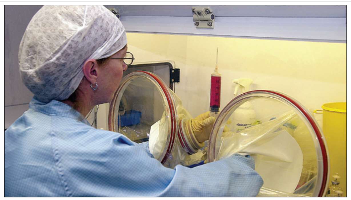
Isolator clean room

2. Air flow and pressure differential requirements should be reviewed in conjunction with the project pharmacist, and the MHRA