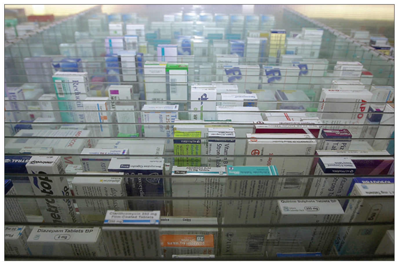
Medicines storage for use with dispensing robot