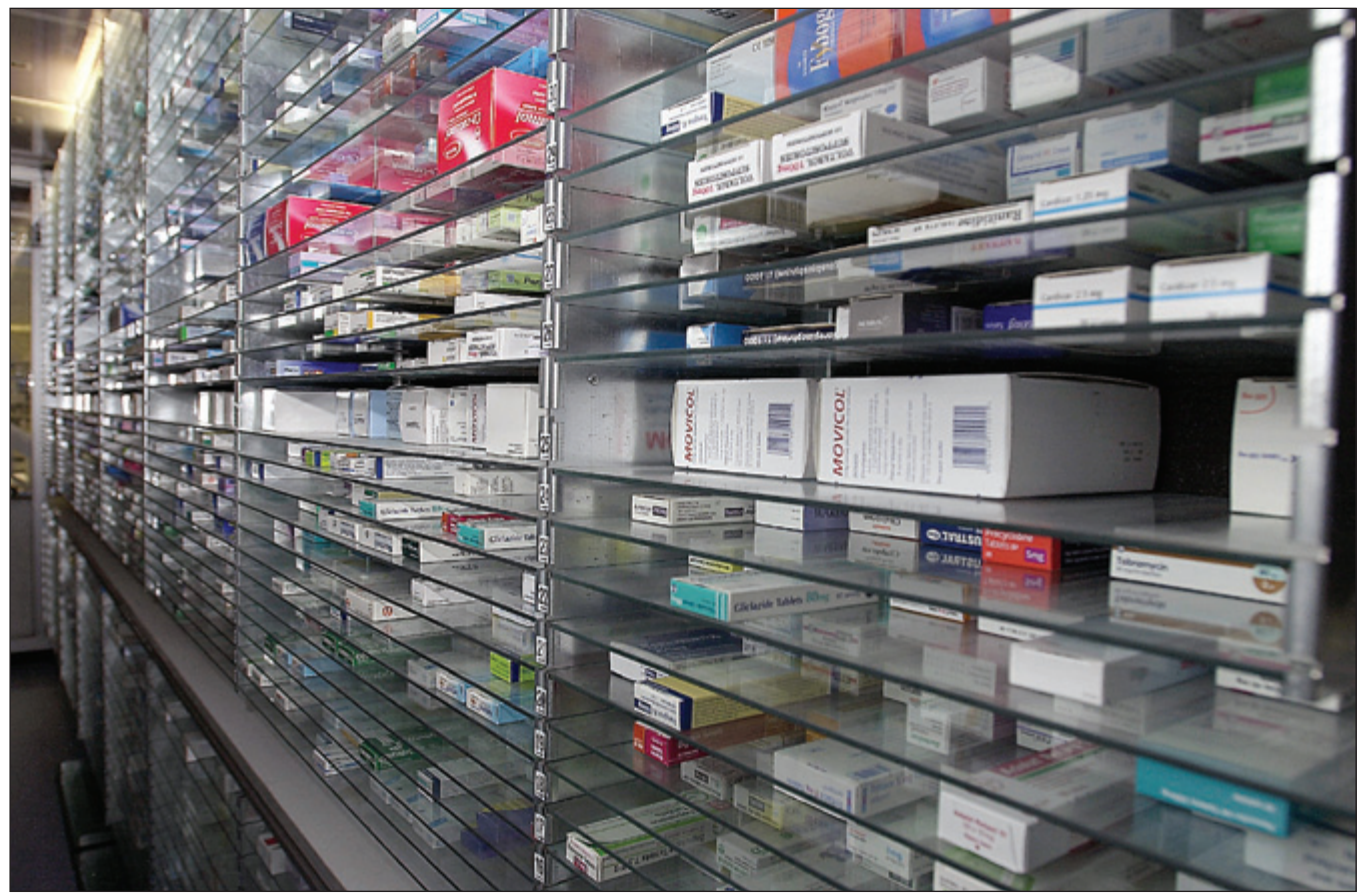
Medicines storage for use with dispensing robot