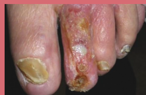
FIG. 2 From left to right: pressure damage over the second toe, which has developed clinical infection; BBM swab wrapped around a toe ulcer; The same toe free from infection, and healing after 7 days of using BBM.