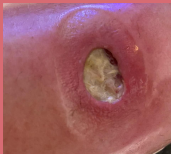
FIG.1 Pressure ulcer medicated with iodoform gauze (IG) in a patient at our clinic

The performed analysis showed that, in the single service, the cost of BBM is 3% higher than IG, but in prolonged treatment the use of BBM is advantageous. BBM, compared to IG, can be left in place for up to 7 days reducing care costs (MD and WCS service) and the frequency of wound manipulation, limiting clinical complications and eliminating the risk of systemic iodine absorption caused by the IG.