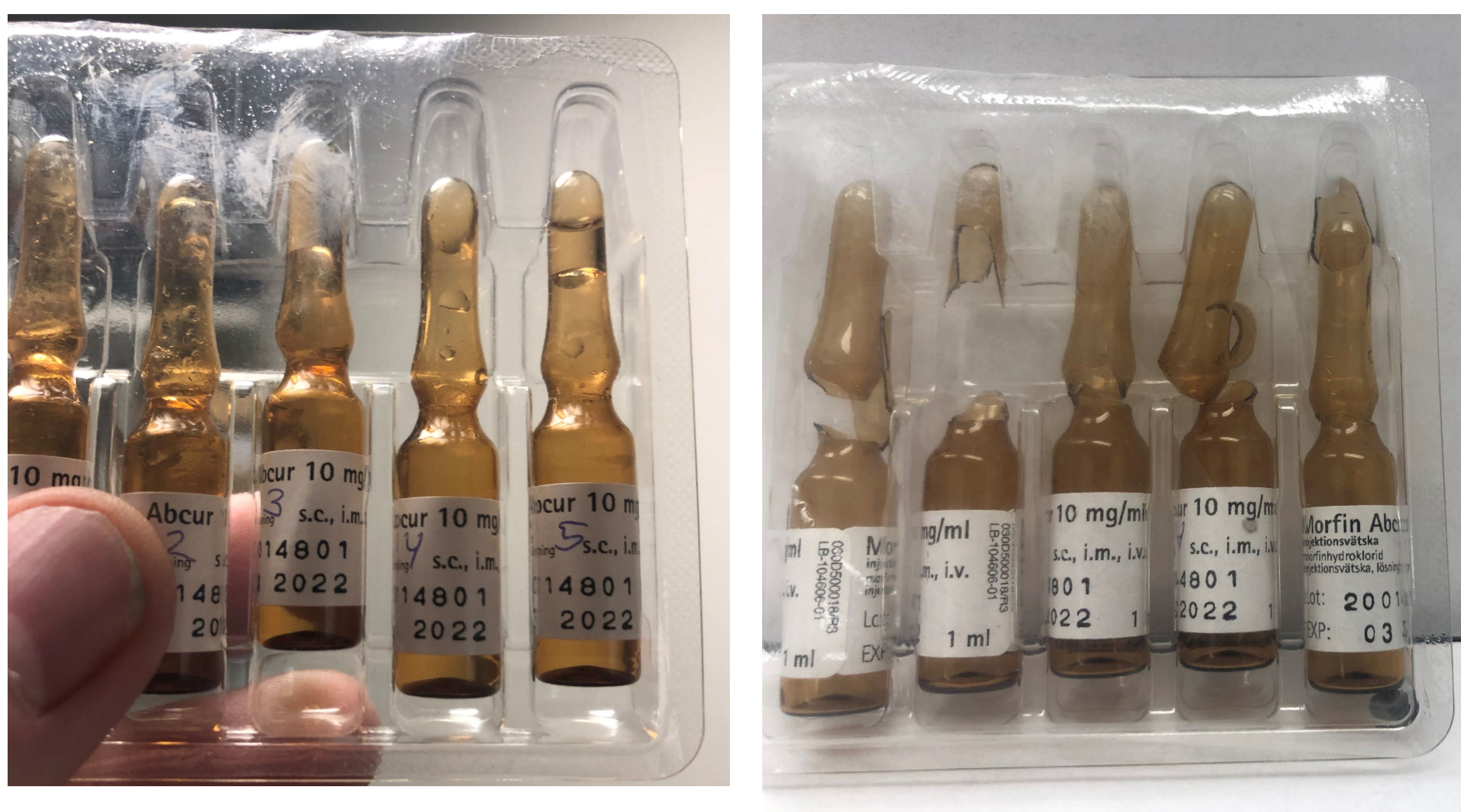
Figure 1. Morphine (Morfin Abcur 10 mg/mL) glass ampoules. Before (A) and after (B) opening.

The health care professionals (HCPs) at the Paediatric Emergency Ward suspected that morphine glass ampoules had been manipulated. They discovered that the seal of the outer packaging was broken and when snapping the vials open, the vials would break in an unusual and uneven way (Figure 1B). Simultaneously, the HCPs discovered that one of the paediatric patients had not received the anticipated analgesic effect of the ordered morphine infusion (Figure 2, Sample S1 in Table 1).