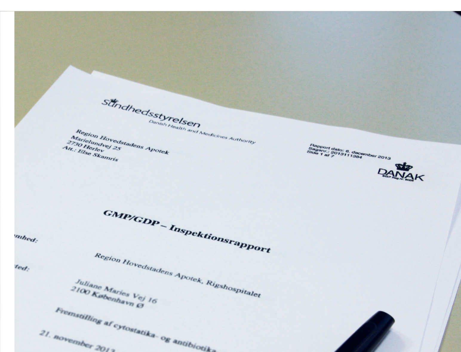
GMP inspection and certificate