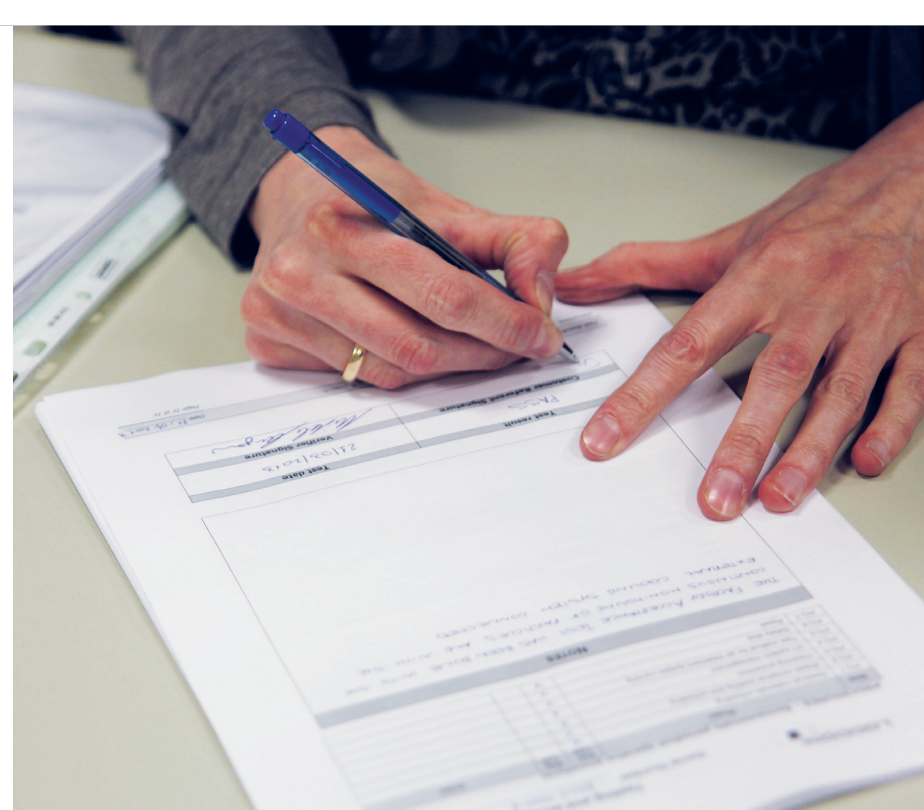
Site Acceptance Test