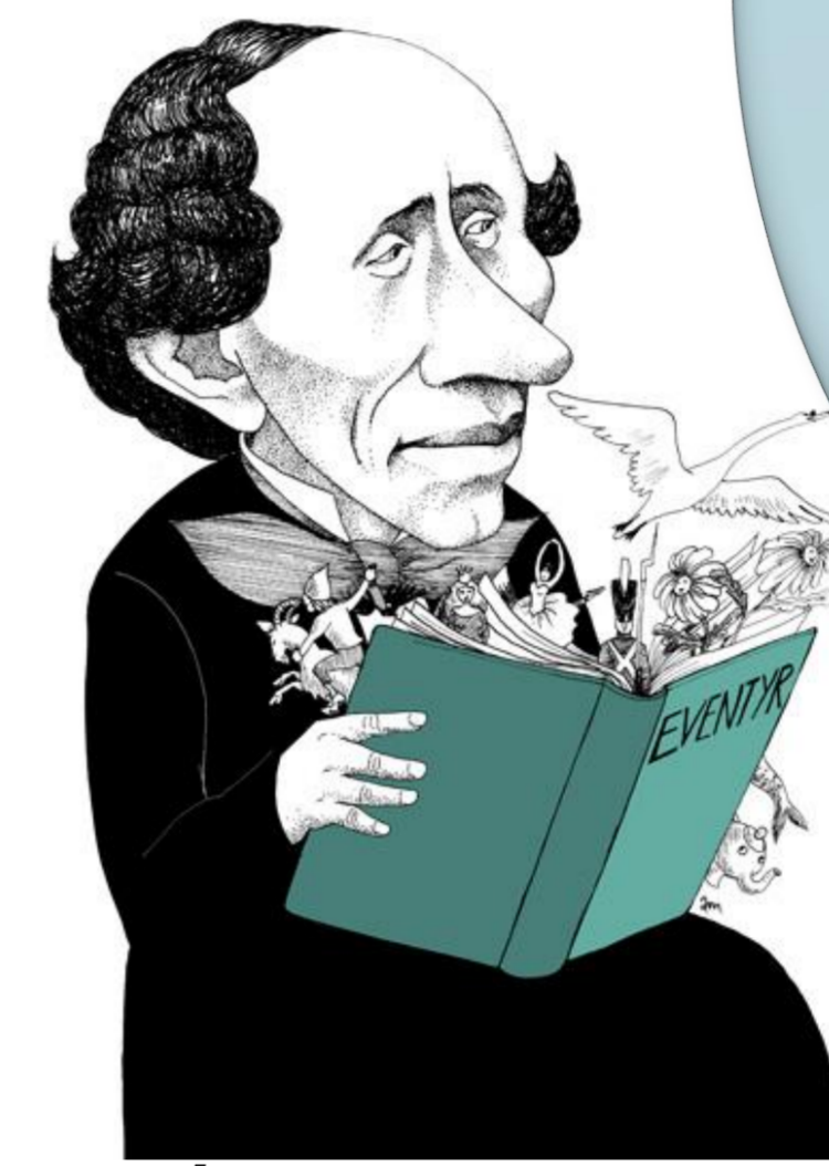
Hans Christian Andersen