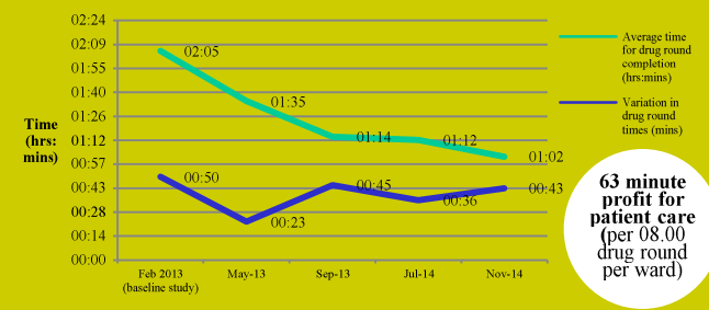
Fig 3: Drug round average timing and timing variation

The project was rolled out in May 2013, with re-audits in September 2013, July 2014 and November 2014. This also incorporated the relocation of the ward from a multiple bedded room configuration to a entirely single bed configuration.