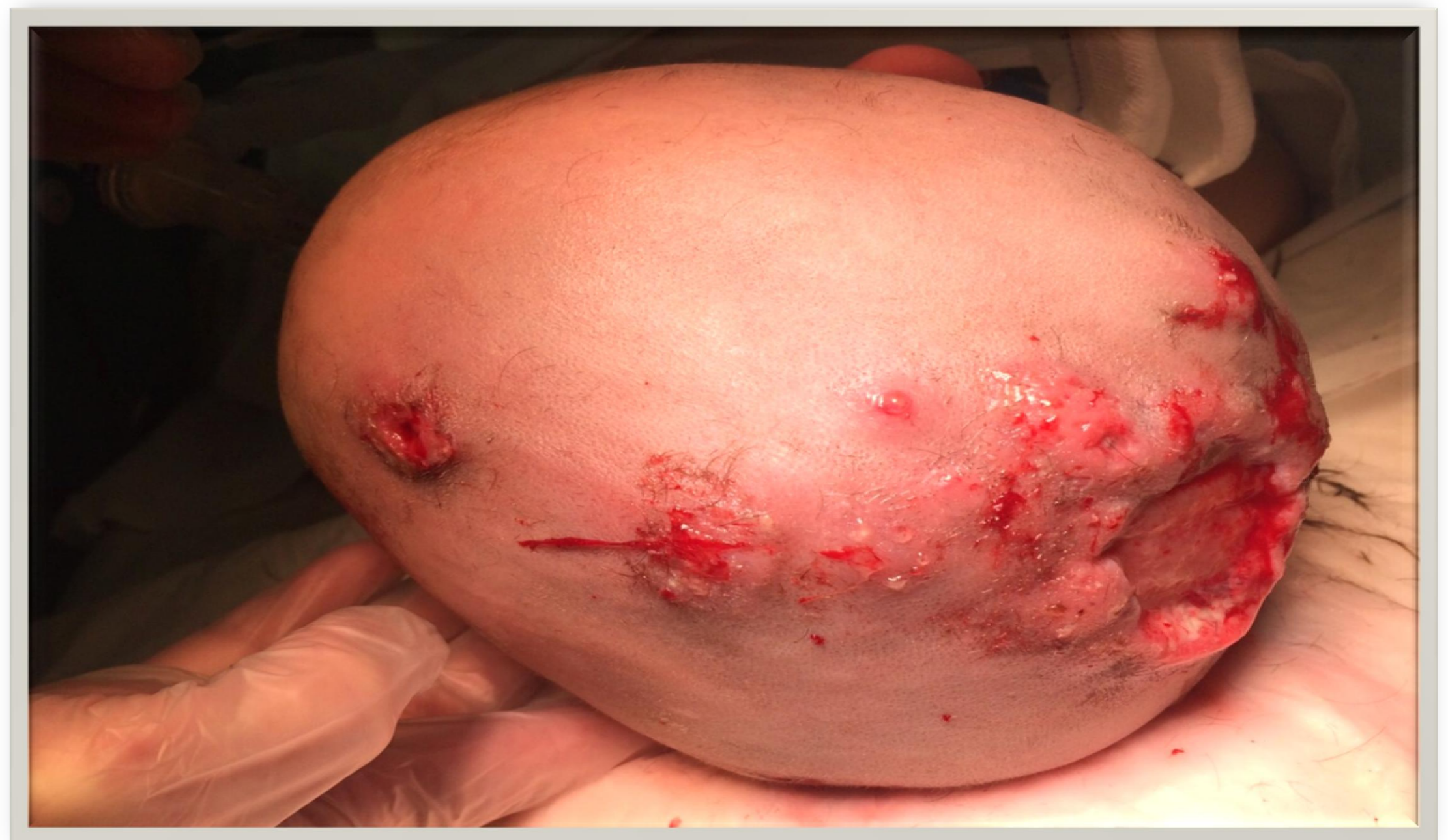
Photograph on day 13th after admission