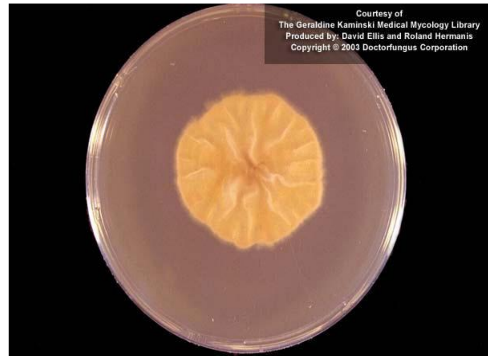
Culture of T. verrucosum on mycobiotic agar