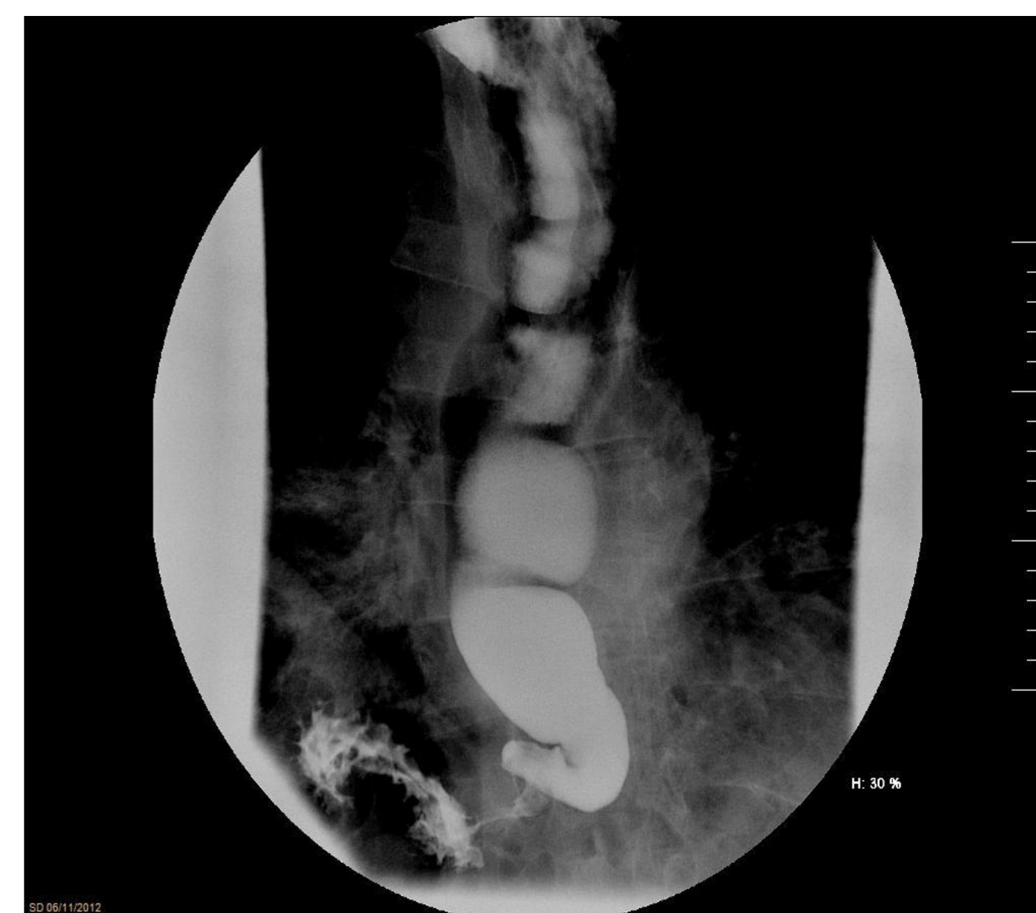
Fig. 1 Barium swallow showing dilated esophagus with retained column of barium and "bird's beak appearance" suggestive of achalasia

The endoscopic findings as well as the clinical response to the botulinum toxin type A use supported the diagnosis of esophageal achalasia. In this case the injections were very effective. The results published in several clinical trials and reviews suggest that the intra-mucosal injection of botulinum toxin type A is a safe and effective endoscopic treatment of dysphagia due to esophageal achalasia. Thus, in patients who for various reasons are not candidates for aggressive treatments such as pneumatic dilation or surgical myotomy, the use of botulinum toxin type A appears to be an excellent treatment option.