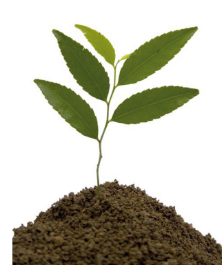
Our futures depend on the choices we make in the present. The European Summit on Hospital Pharmacy is designed to map the future of hospital pharmacy profession and the services it offers to patients and other health professions.