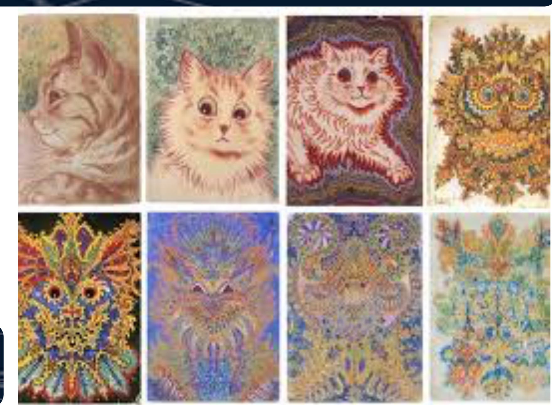
Figure 1. Schizophrenia

The 3-monthly formulation of paliperidone palmitate (3MPP) was introduced to the Italian market in 2017 for the treatment of schizophrenia in adult patients. 3MPP is a useful treatment option for patients who are adequately treated with the 1-monthly formulation of paliperidone palmitate (PP), however may benefit from longer dosing intervals.