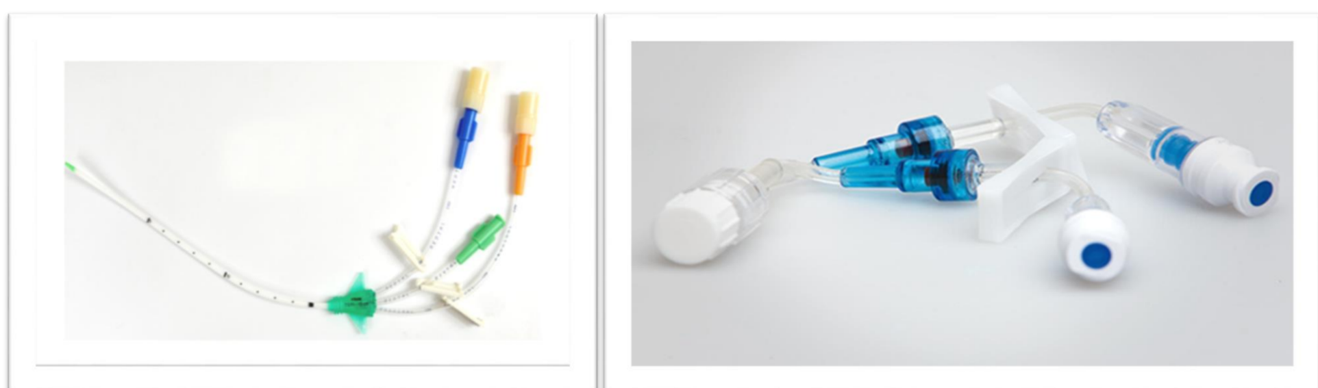
Figure 1. Triple lumen central catheter (left) and a Y-site connector (right)