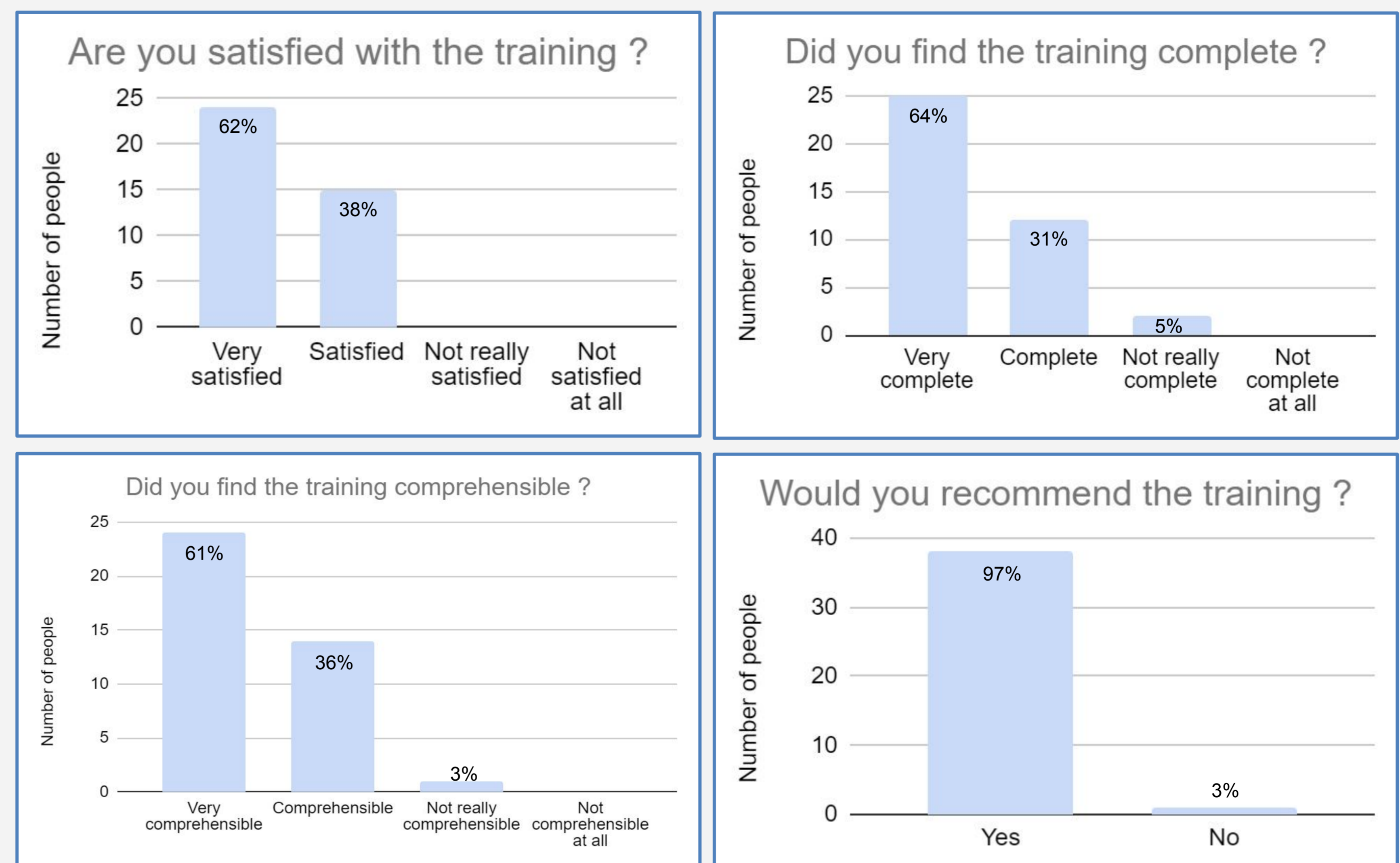
Fig. 2 : Results for the four questions of our satisfaction survey (n = 39).