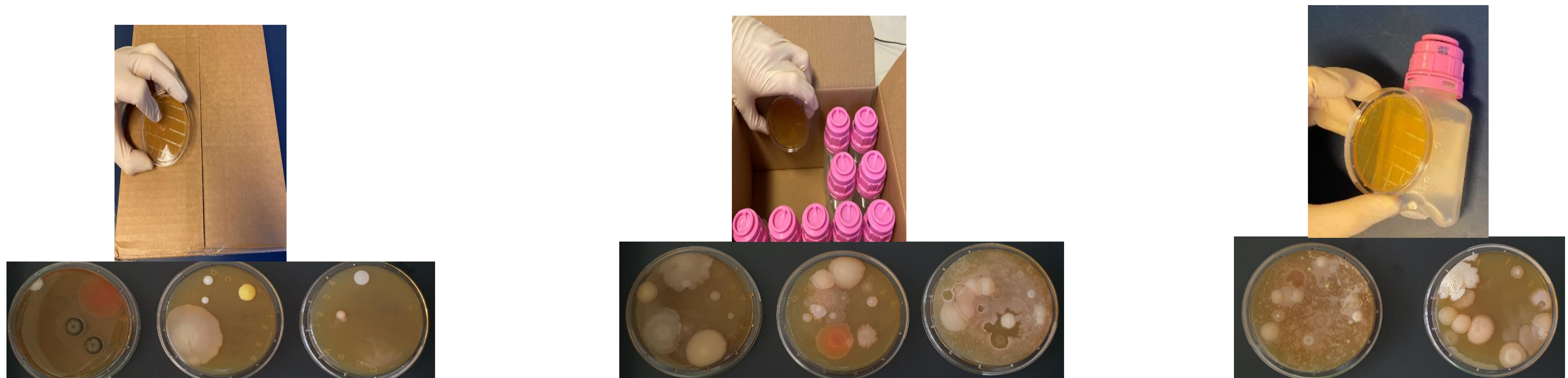
2.a: Contaminated Samples cardboard boxes outer side