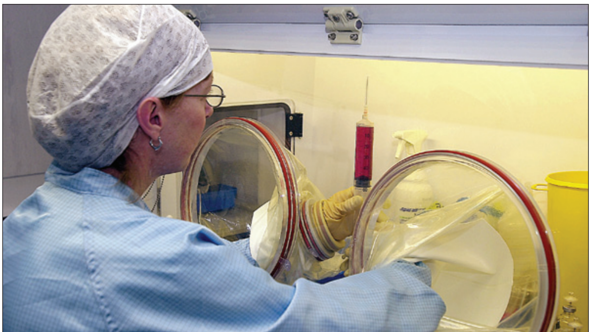
Isolator clean room