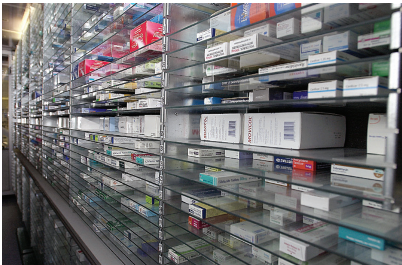
Medicines storage for use with dispensing robot