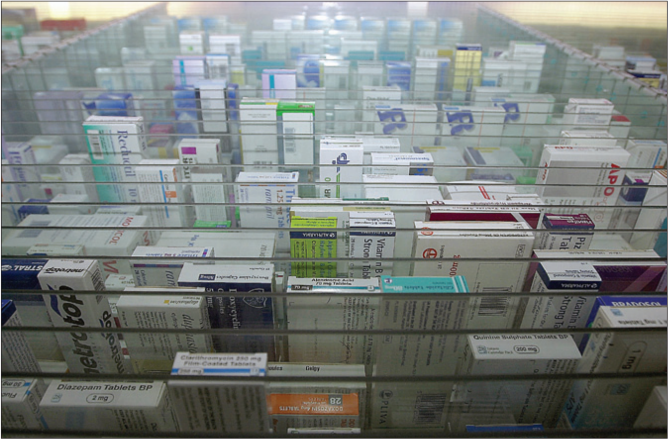
Medicines storage for use with dispensing robot