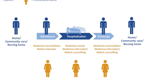
Figure 3: Illustration of the IMM-model in a standard patient care way, depicting roles, settings and tasks

A literature review was conducted. Based on this, a multidisciplinary project group decided that all clinics and wards were eligible for clinical pharmacy services and should receive extensive information on the topic. The funding from the Regional Health Authority was also based on the IMM-model. As there were limited resources allocated, all clinics were asked to apply for the service. The hospital management received applications three times the number of funded clinical pharmacists.