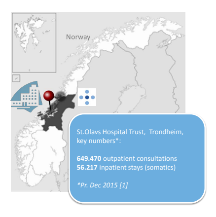
Figure 1: Map of Norway showing the Central Norwegian Region and St.Olavs Hospital in Trondheim (red pin).

A dialog based process involving hospital management, clinicians and the pharmacy led to a large increase in clinical pharmacy services in St. Olavs Hospital. For geographical and organisational overview, see Fig. 1 and 2.