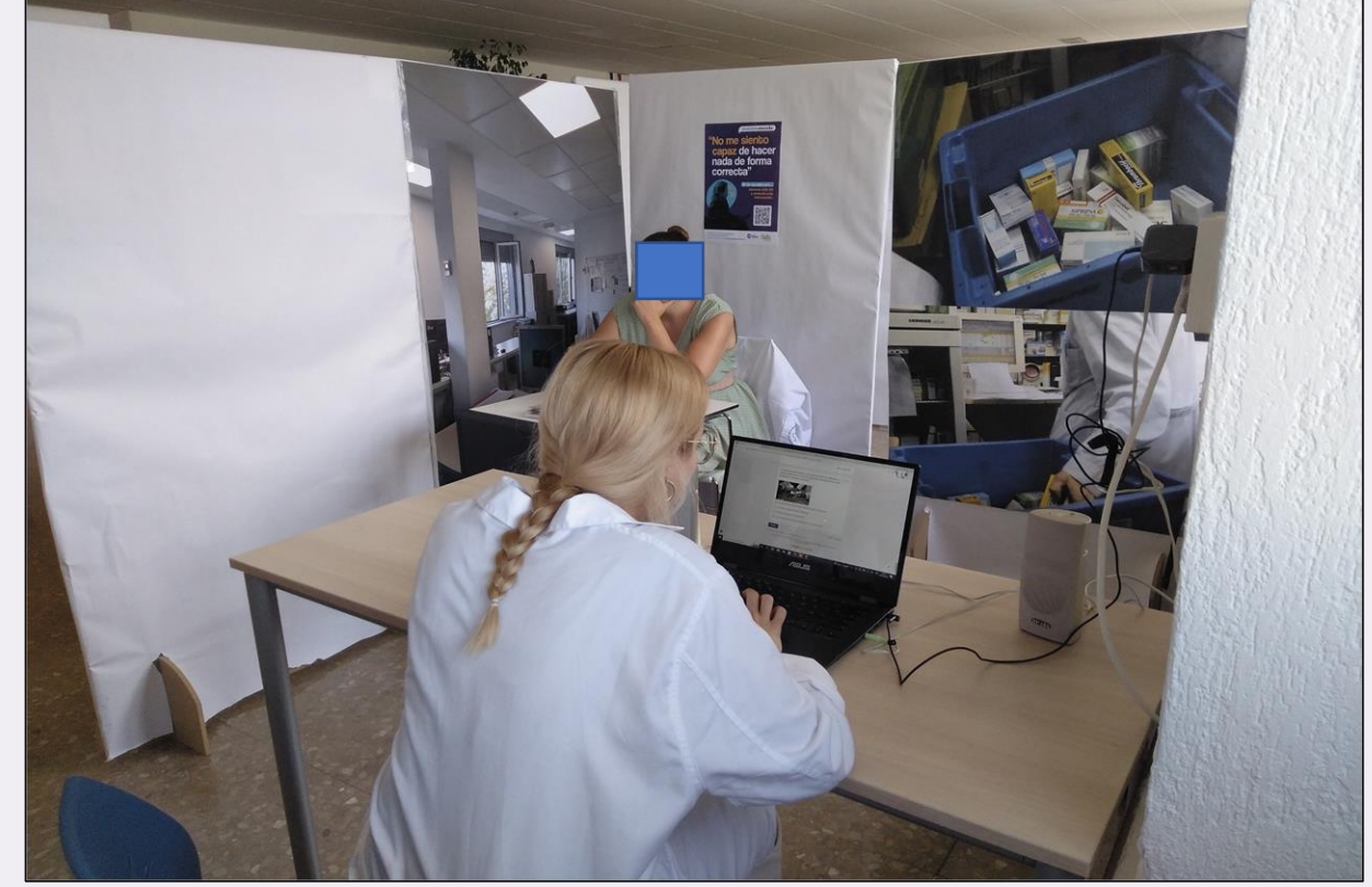
Students during an objective clinical assesment