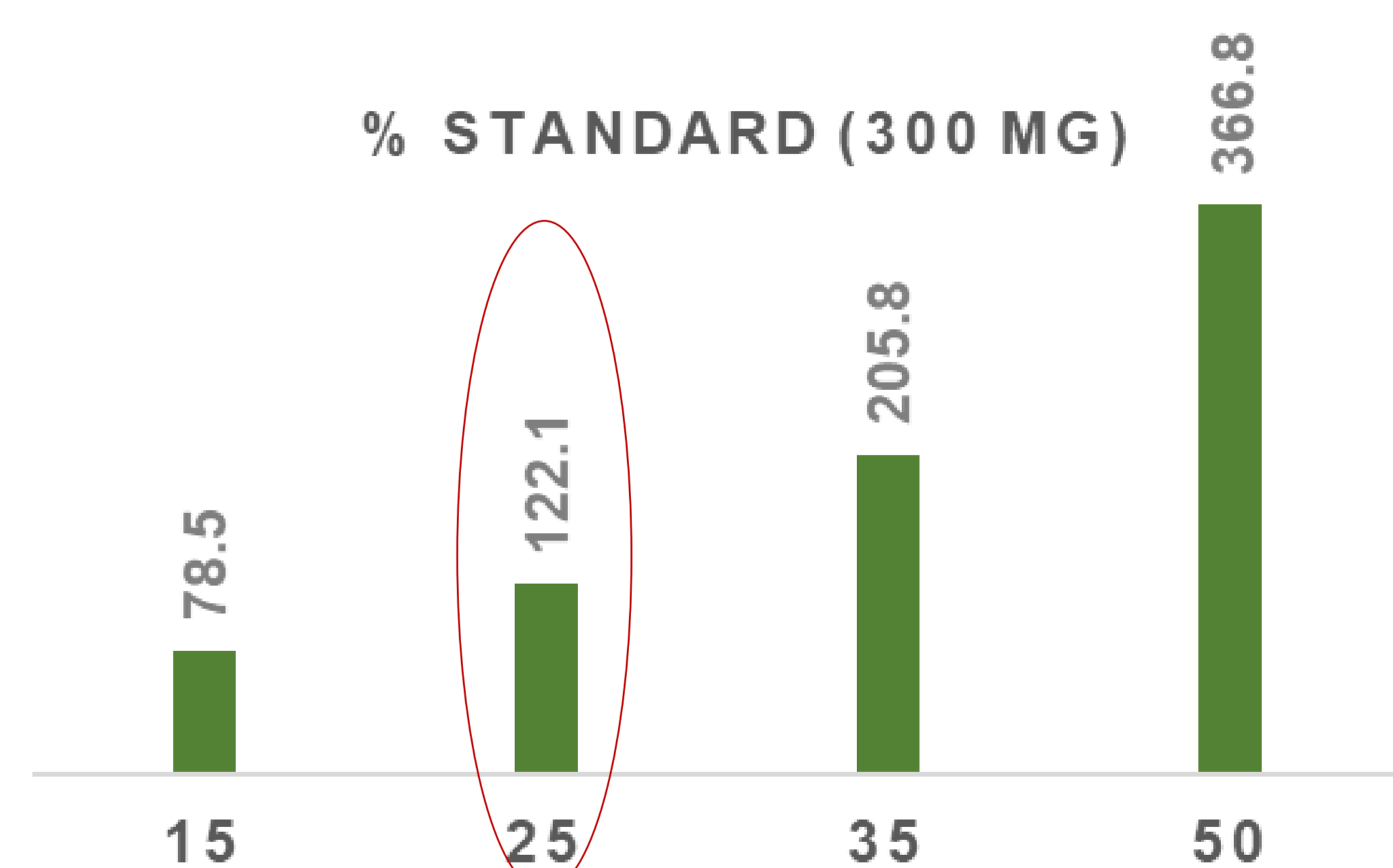
Figure 1. Correlation between strip surface area and fluorescein release (%)

Observation: Direct correlation between surface area and fluorescein sodium release.