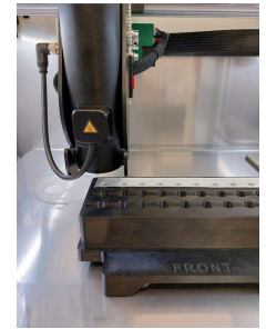
Fig. 2: machine production