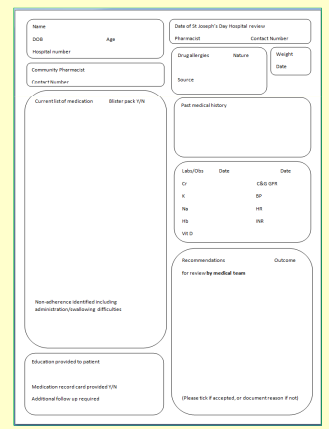
Figure 2: Pharmaceutical care plan

Data from the first three months of the service were collected prospectively to measure the quantity, type and quality of CP interventions.