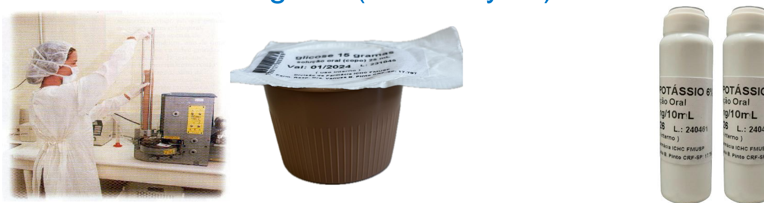
Figure 2. Packaging sealing failure and new package.