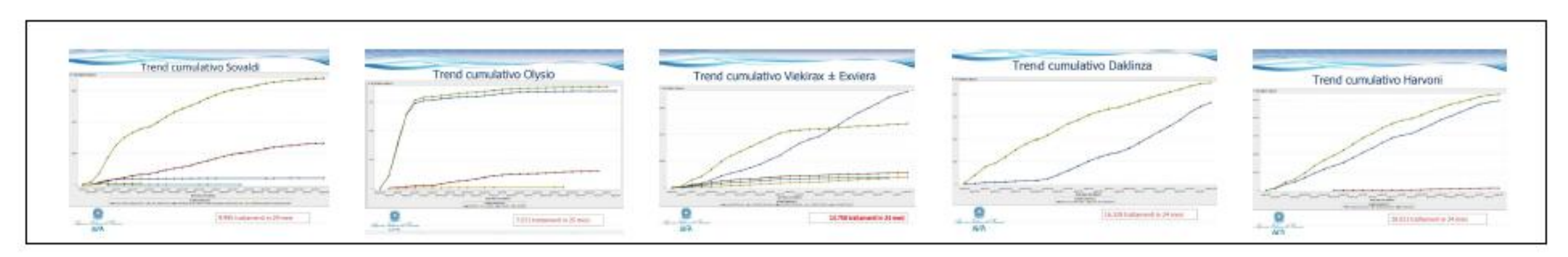
Figure 1. National cumulative prescribing trend

Local electronic monitoring prescriptions of DAA-2 made from January 2015 to February 2017 were extracted from the National monitoring prescriptions database. The number of prescriptions for each DAA-2 was extracted. Qualitative and quantitative presentation of local data was adapted in order to make them comparable to available national data. Both local and national monthly average drug prescription for each DAA-2 was assessed considering the number of months of commercialisation of each DAA-2. Local and national prescribing trends were assessed and compared.